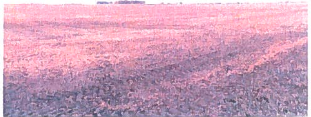
At NE Corner > SW