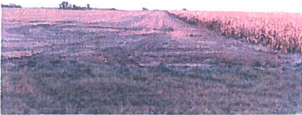
At Middle W Side > E