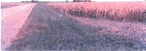
At SW Corner > N

HARMON 'W' TOWNSHIP: E1/2NW1/4, GOV'T LOTS 1 & 2 OF SECTION 7-T127N-R49W