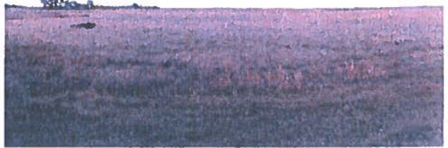
At NW Corner > SE