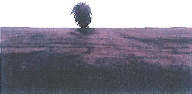
At NE Corner > S